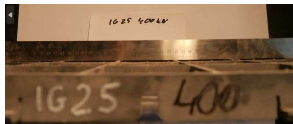
Photo.6. IG25 after the 400kN test