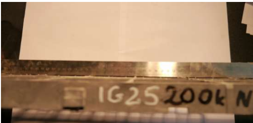
Photo.5. IG 25 after the test at 200 kN