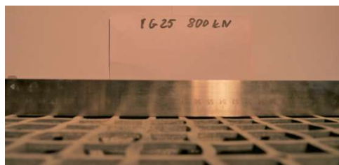
Photo.7. IG 25 after the test at 800kN