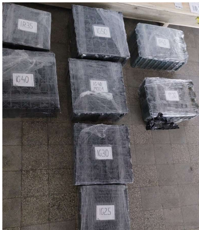
Photo. 1. Test objects

The test object was packed on euro platform. After dispatch no damages were noticed.